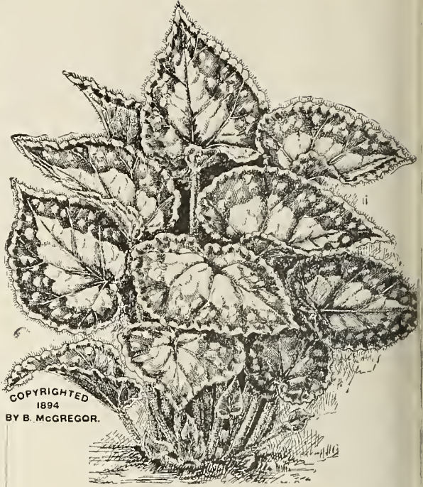
COPYRIGHTED 1894 BY B. MCGREGOR.